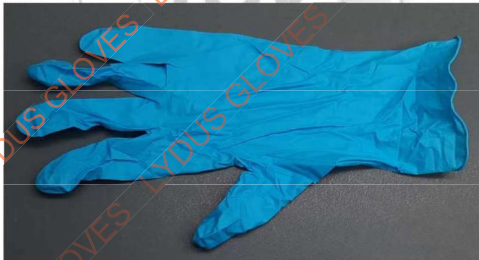
Photo: Nitrile Examination Gloves Non-Sterile Powder Free, Lydus, Lot No. MG202006261, Size M